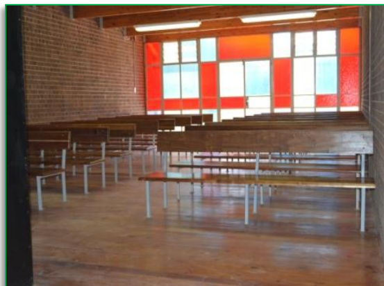
The inmates were taken to this chapel before they climbed the stairs to the gallows. After a brief prayer they were asked to remove their shoes.