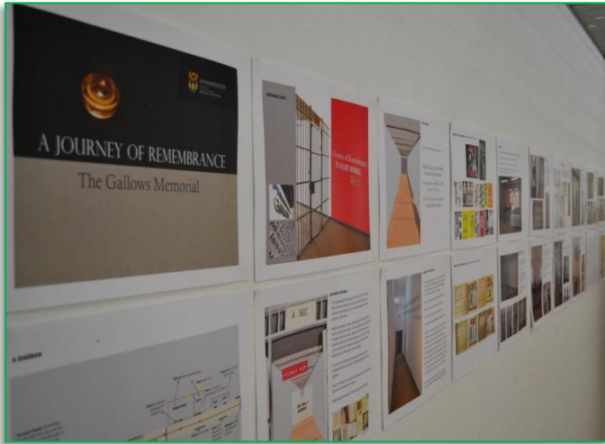
At the entrance to Pretoria Correctional Centre, a collage of posters explains the process leading up to execution at the gallows. It introduces the visitor to life on death row.