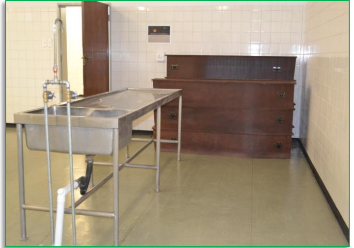
The autopsy room. Dead bodies were cleaned on such a metal table before being placed in coffins.