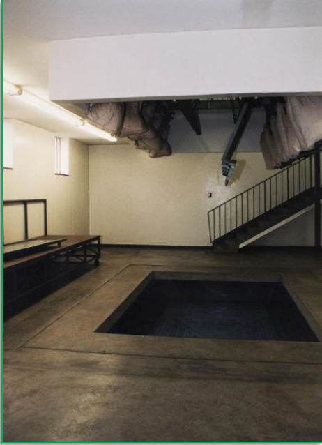
The blood catch pit below the hanging chamber.