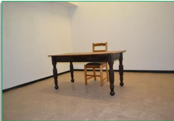
The feedback room. This is where an inmate was told when they will be executed or whether they were pardoned.