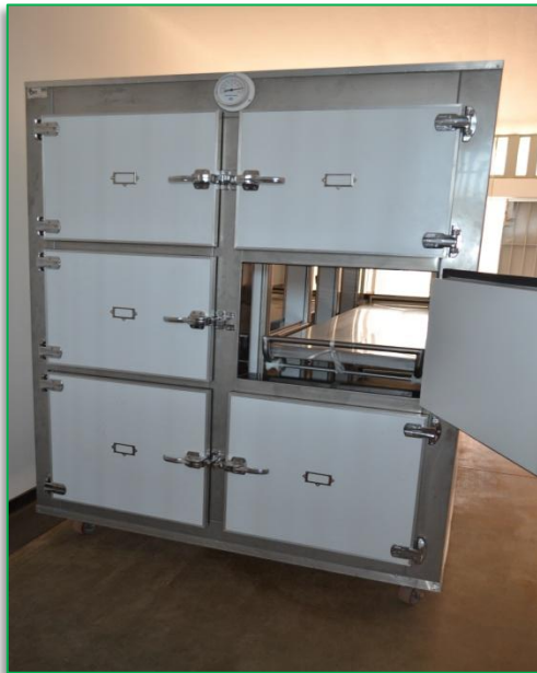
The fridge room, corpses were kept here before the burial.