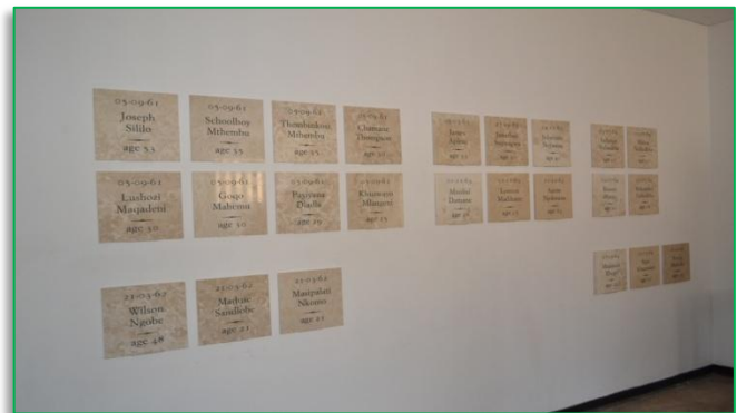
Name plaques of the 130 political prisoners appear on the gallows walls, grouped as they were hanged.