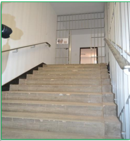
The 52 stairs that inmates climbed on their way to execution