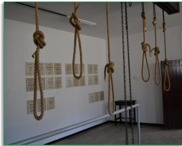
The ropes used to hang seven prisoners at a time.