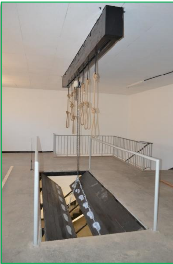
The hanging chamber used for executions.