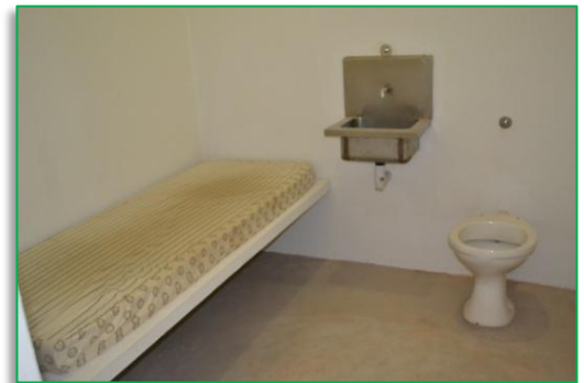
Inmates to be executed were kept in this cell as they awaited their last journey of life.