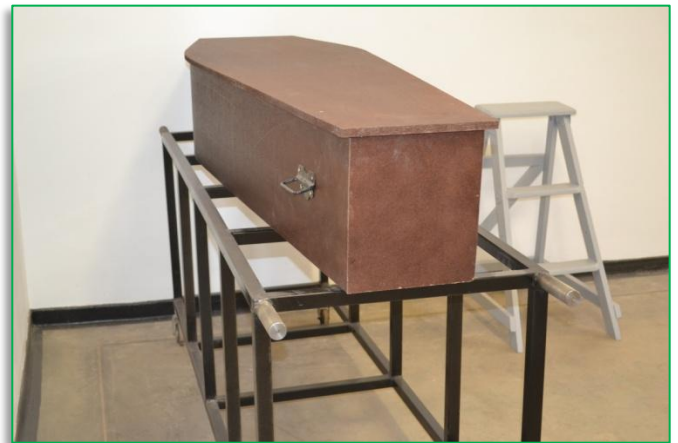
The body of each executed inmate was placed into a coffin for burial at the cemetery. Muslim prisoners were buried according to their tradition.